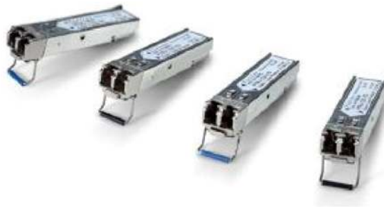
Figure 1. Gigabit Ethernet SFP

The industry-standard Cisco® Small Form-factor Pluggable (SFP) Gigabit Interface Converter is a hot-swappable input/output device that plugs into a Gigabit Ethernet port or slot, linking the port with the network (Figure 1). SFPs can be used and interchanged on a wide variety of Cisco Systems® products and can be intermixed in combinations of 1000BASE-SX, 1000BASE-LX/LH, 1000BASE-ZX, or 1000BASE-BX10-D/U on a port-by-port basis.